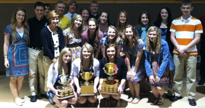
LV brings home all three Licking County Operation Feed trophies in the school category for the 3rd year in a row.