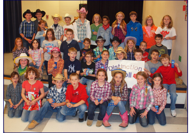
The Intermediate School had a Renaissance Rally for the 1st nine weeks on Nov. 4th to recognize students for their academic excellence.