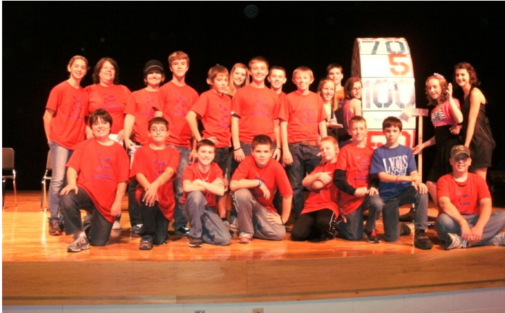
Middle School Renaissance celebrating academic excellence for the entire school. "Let's Make A Deal"